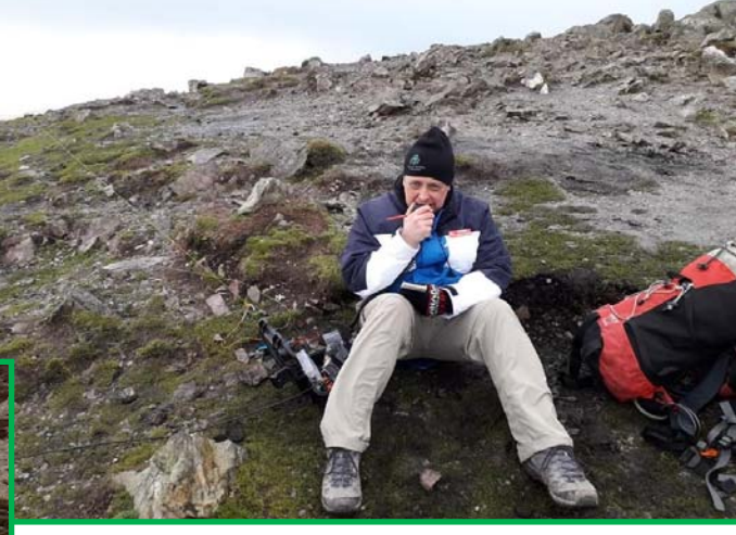
Photo 3: Great Sugar Loaf - EI/IE-022 as EI/VA2EI