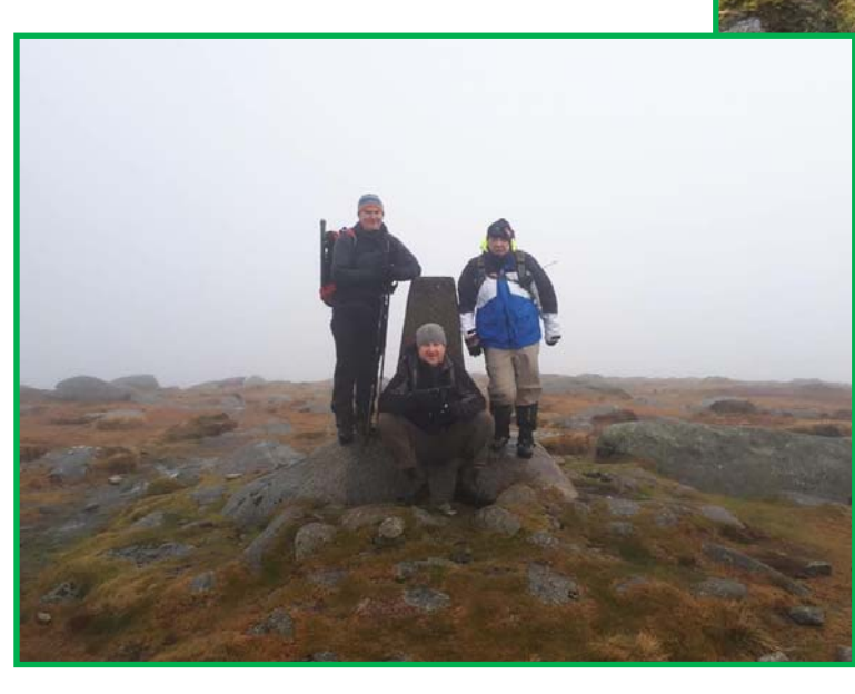
Photo 6: Tonlagee EI/IE003 as EI/VA2EI