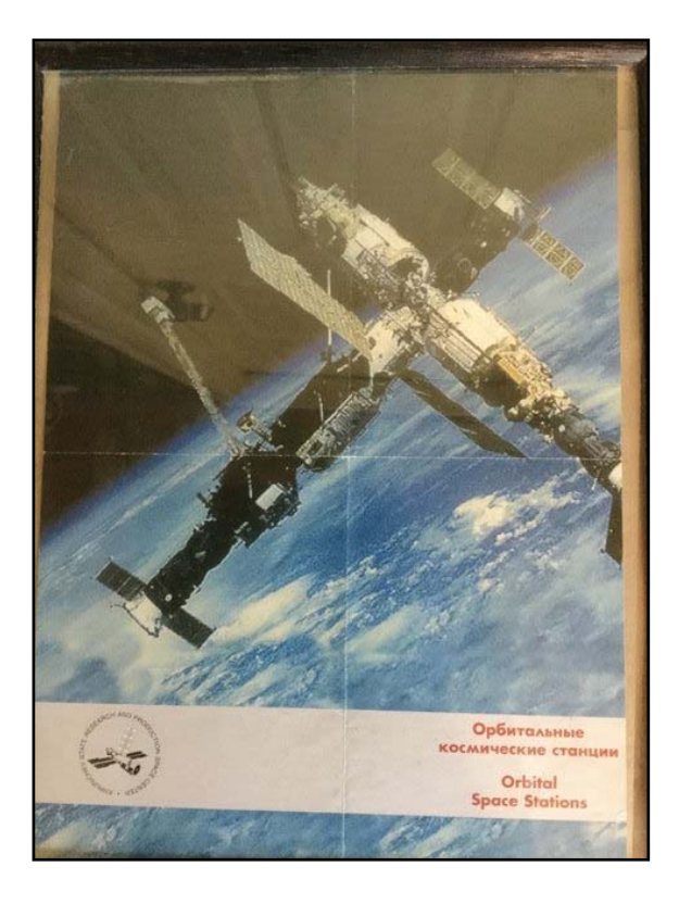
The Picture. A thank you for assistance to MIR.