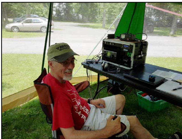
VE2DDZ, the laid-back operator.