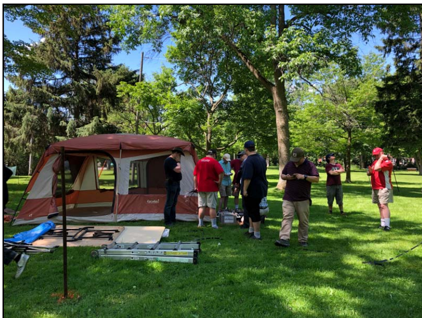
Setting up the main station.