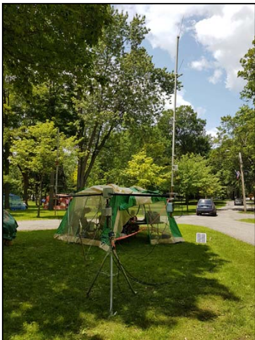
The satellite station.