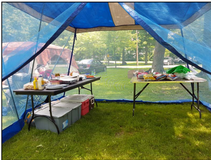
Power for the humans ...