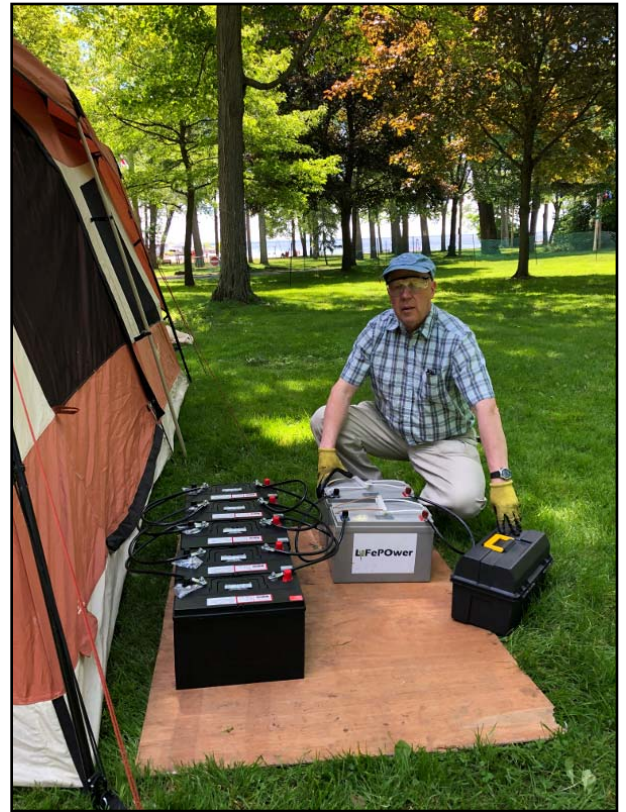
VE2SI and battery bank.