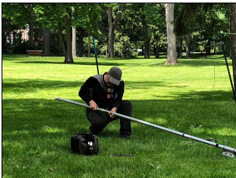
VE2EVN assembling the 6m mast.