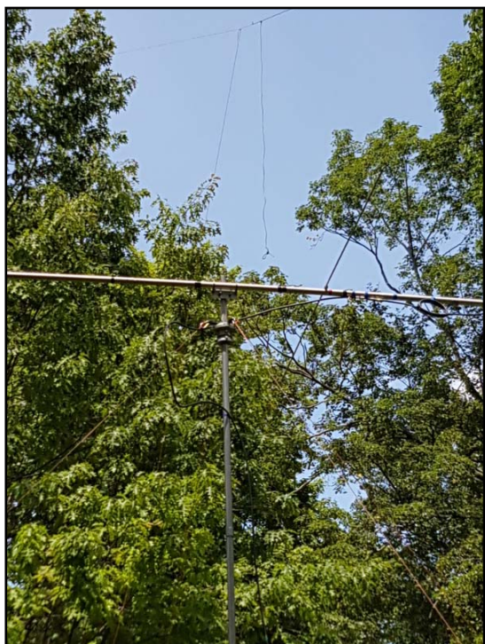
The 6m beam and the dipole.