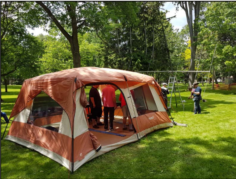
Erecting the 6m mast and beam.