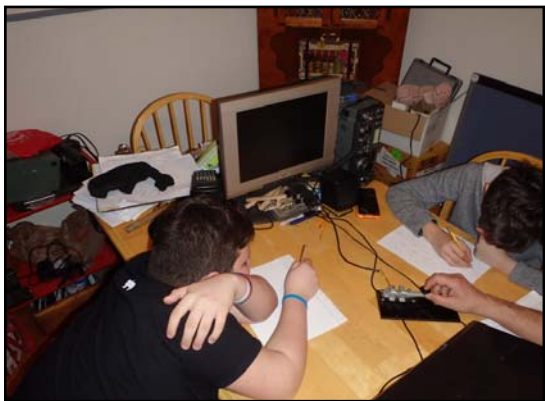
Practice code receiving.