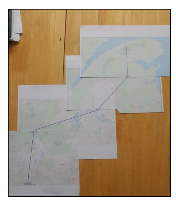
Fig. 2: From Mount Washington NH in the South through Mont Saint Joseph QC to Katadin, Carleton QC and up to Mont Blanc in Matane QC.