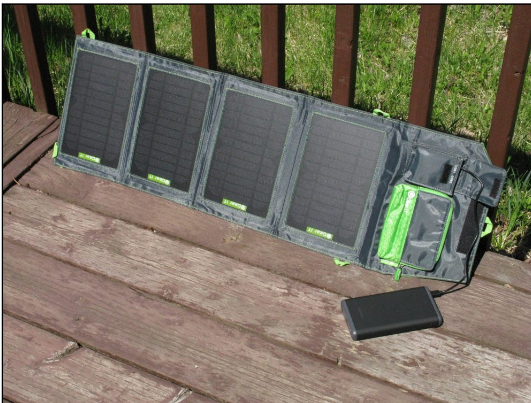
Insignia battery pack charging from a Gear IT foldable solar panel.