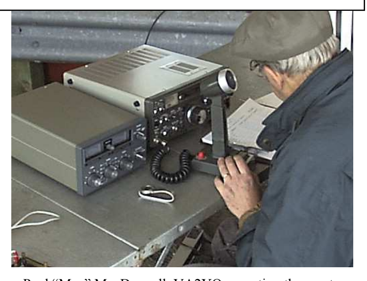
Paul "Mac" MacDougall, VA2YQ operating the amateur radio station set up at CN Family Day at Taschereau Yard in the fall of 2000.

Communications support can take various forms and what is important is that it meets the needs of those needing to pass information.