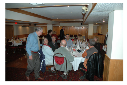
MARC 75th. anniversary dinner, October 21, 2007 at Antico Martini

This is what was holding up one end of the HF antenna. Unfortunately they wouldn't let us take it home.