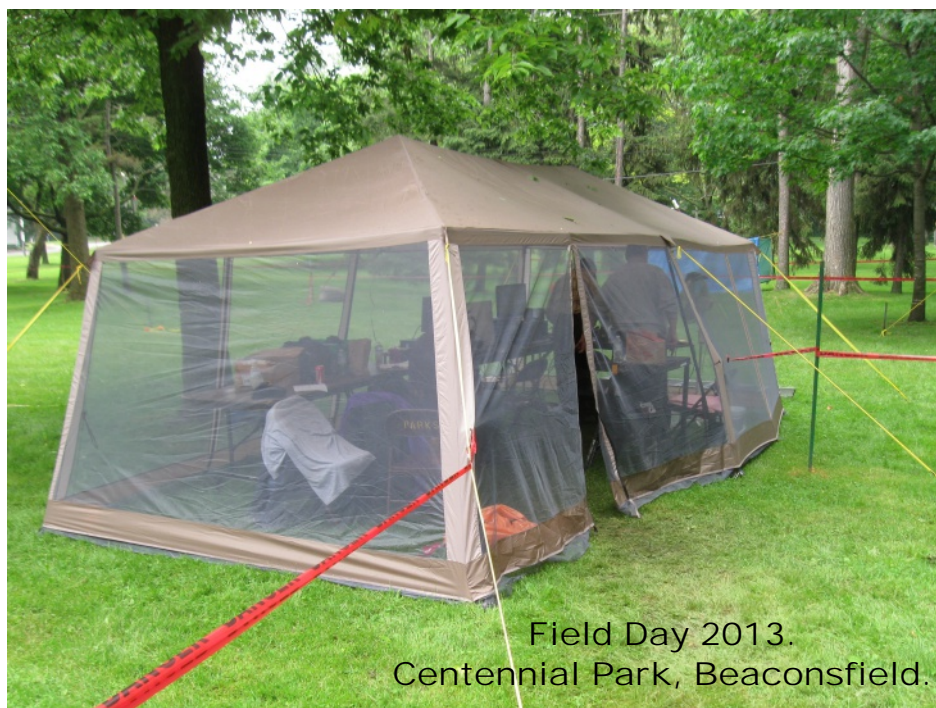
Field Day 2013. Centennial Park, Beaconsfield.