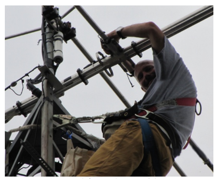
A Word from the President