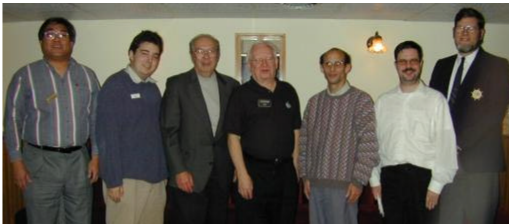
The Montreal Amateur Radio Club board of directors