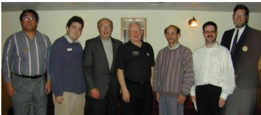
The Montreal Amateur Radio Club board of directors