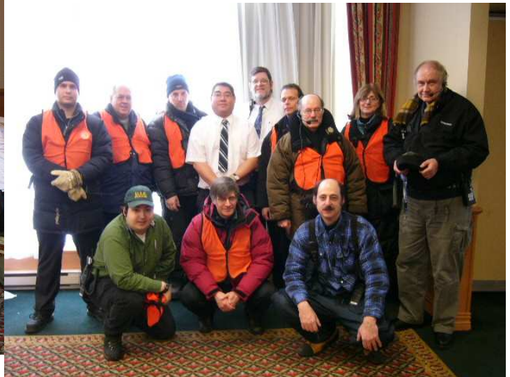
This picture was taken after the 2007 St. Patrick's parade and shows the amateur radio operators who provided communications assistance