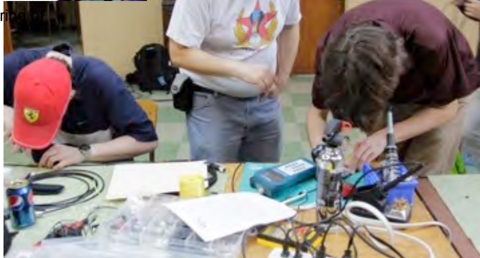
Two students working on their project.

All photos in this issue by Ron Campbell, VA2RJC.