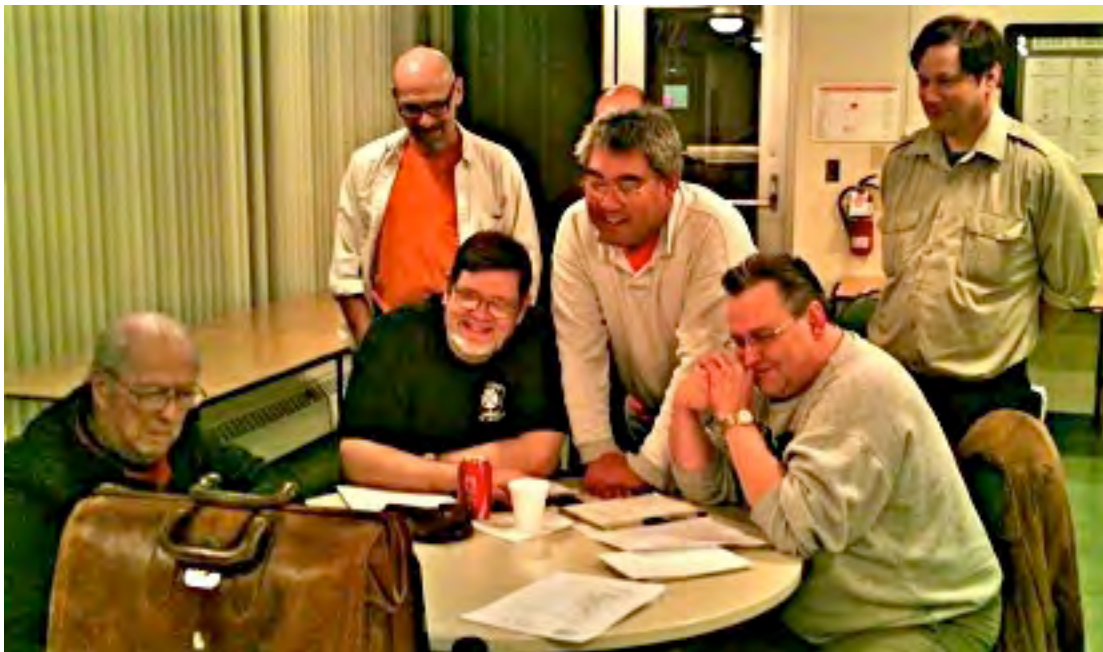
Your BODs being entertained at their May 2011 meeting. They were watching a video taken at the Solderspot session on April 29, 2011