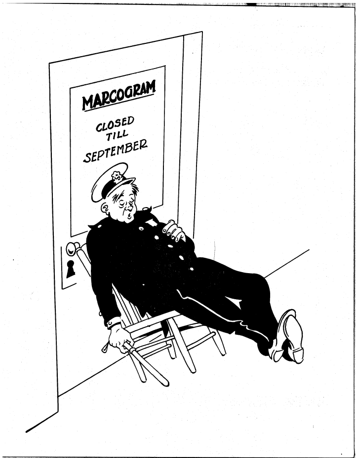
From the May 1972 issue of The Marcogram.