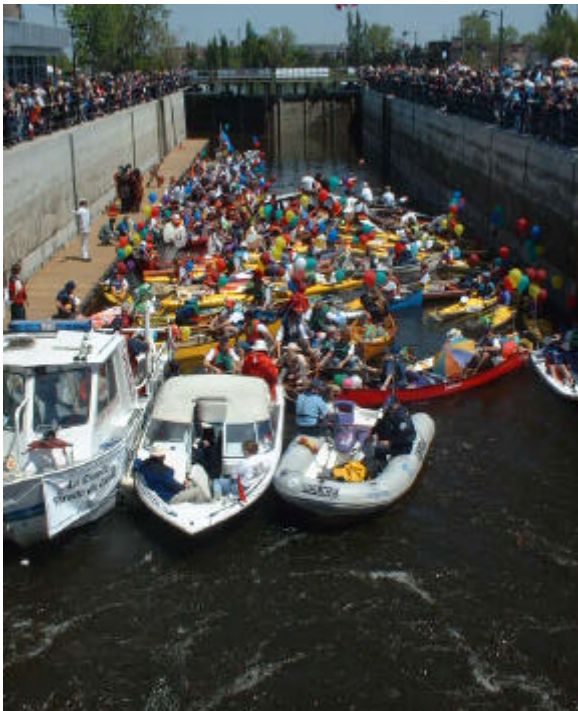
Action at the Cote St Paul lock during "The Grande Parade du Canal."