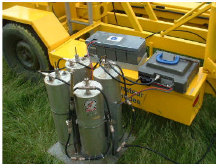
The repeater equipment used at Blainville this year.