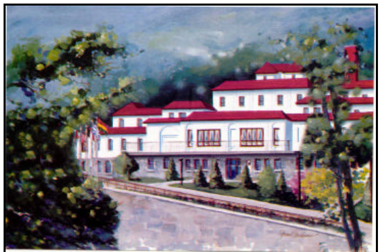
The special QSL card, showing the Montreal Shriners Hospital, to mark the operation of the special event station.